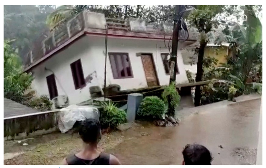
A few seconds later this house slid into the river below.

So, it would be blessing if we can provide them a help of 6000 Rupees (£60) (for purchasing essential kitchen appliance) and a food kit for each family for 1000 rupees (£10) for a week. This would be very helpful. Please think about these most urgent items.